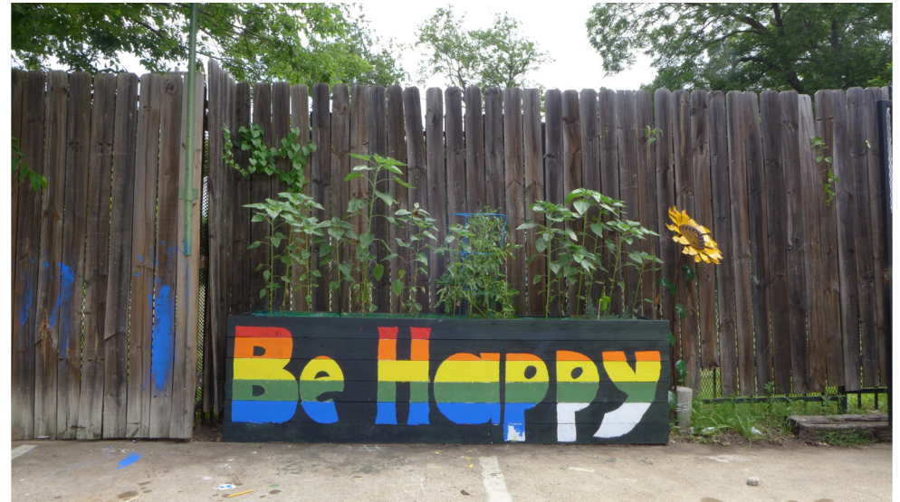
Above: Peace garden made by volunteers at Mosaic House