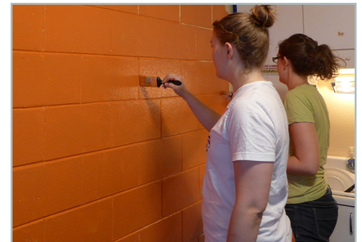
Right: Volunteers from Bain & Company paint kitchens in Mosaic House