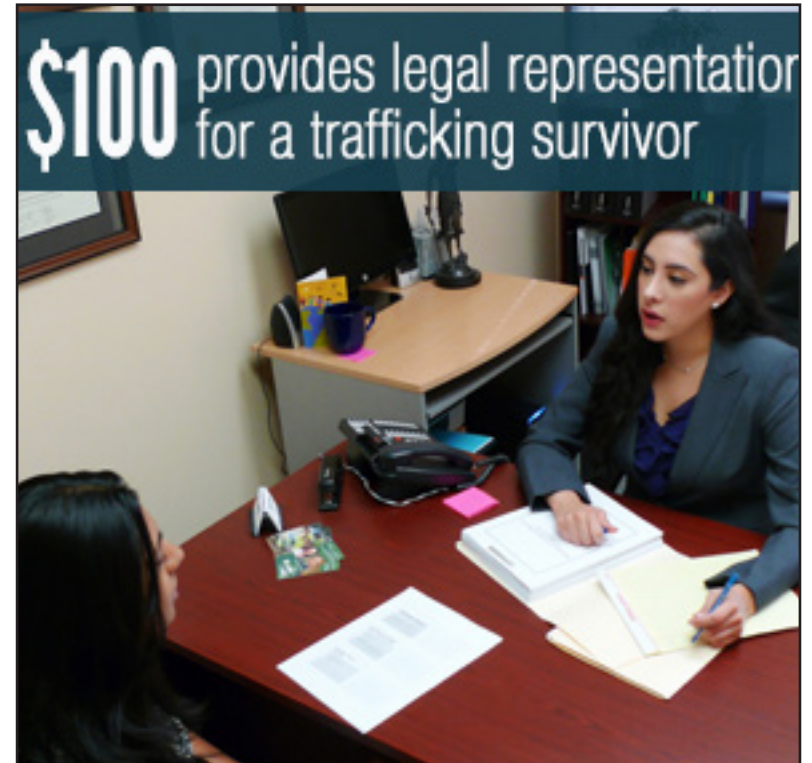
An attorney helps her client understand her rights

WE DON'T HAVE TO ENGAGE IN GRAND, HEROIC ACTIONS TO PARTICIPATE IN THE PROCESS OF CHANGE. SMALL ACTS, WHEN MULTIPLIED BY MILLIONS OF PEOPLE, CAN TRANSFORM THE WORLD.